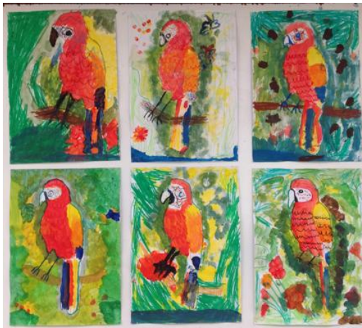
Hedgehog Art afternoon photos from last week. It was a brilliant session.